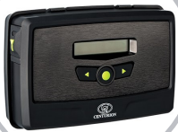
Mobile Phone Gate Access