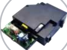
Emergency Battery Backup