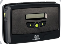
Mobile Phone Gate Access